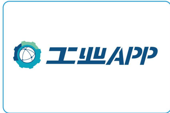
China (Tianjin) Industrial App Innovation and Application Competition