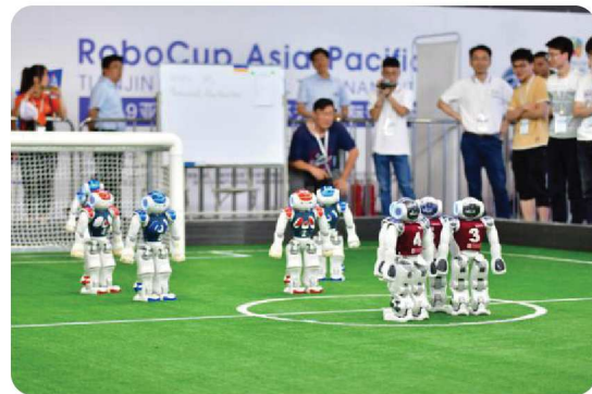
RoboCup Asia-Pacific Tianjin Invitational Tournament 2019