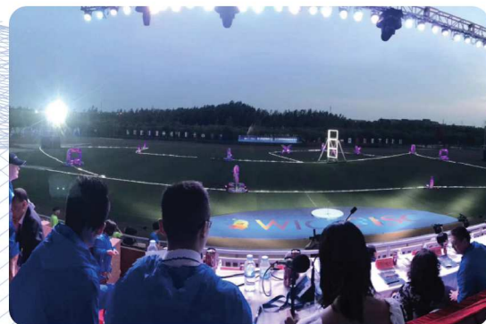
The 1st International Intelligent Games