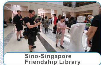
Sino-Singapore Friendship Library