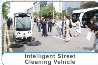
Intelligent Street Cleaning Vehicle