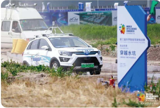
World Intelligent Driving Challenge