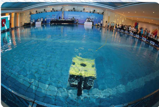
World Intelligent Underwater Robots Challenge