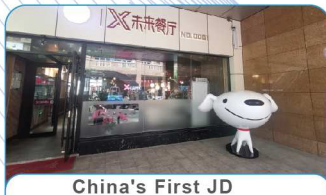
China's First JD Future Restaurant