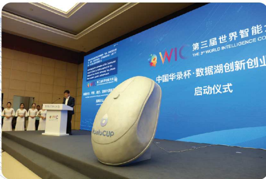
China Hualu Cup - Data Lake Innovation and Entrepreneurship Competition