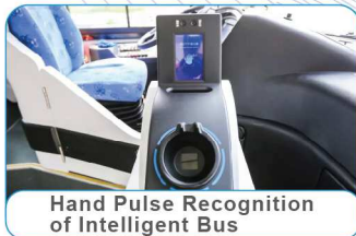
Hand Pulse Recognition of Intelligent Bus