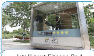
Intelligent Fitness Pod